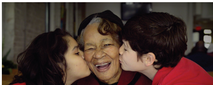
♪ And showing your love ♪