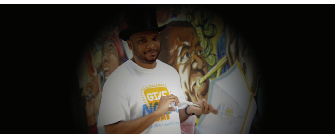
OUR 30 SECOND TV COMMERCIAL