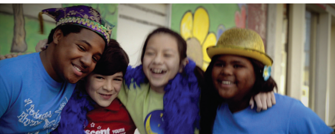
♪ Make it a day of giving ♪