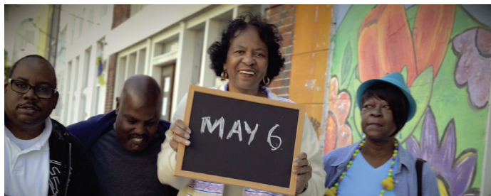
♪ One day in May ♪