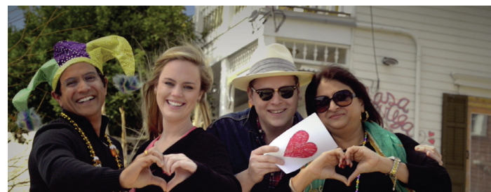
♪ You know you love New Orleans ♪