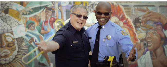
♪ Now show that you care ♪