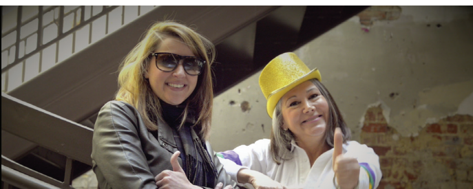
♪ So come on ♪