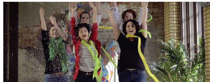
♪ We can celebrate ♪