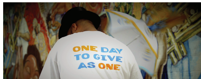
♪ ONE DAY TO GIVE AS ONE ♪